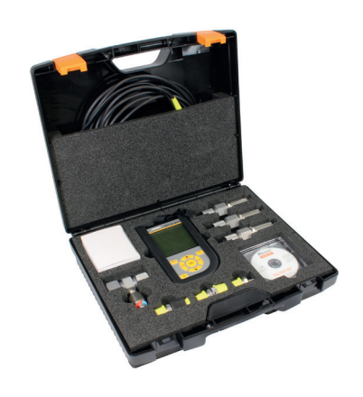
Complete Systems PPC-04-CAN-SET